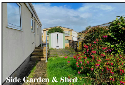
Side Garden & Shed