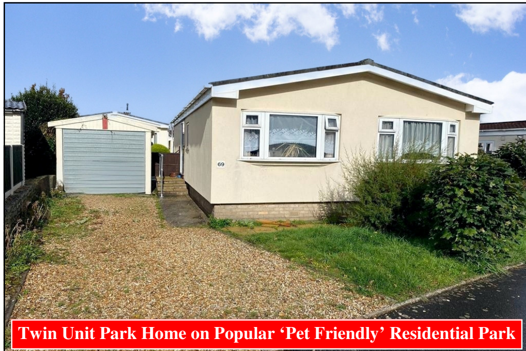
Twin Unit Park Home on Popular 'Pet Friendly' Residential Park

69 Oaklands Park, Crossways, Dorchester. DT2 8JQ