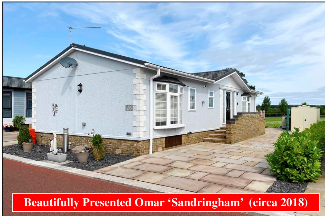
Beautifully Presented Omar 'Sandringham' (circa 2018)

26 Jasmine Court, Organford Manor Country Park, Organford, Poole. BH16 6FJ