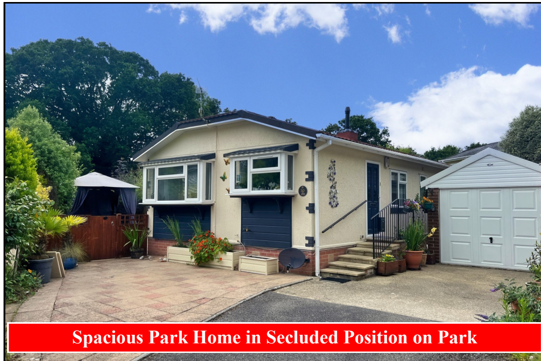
Spacious Park Home in Secluded Position on Park

70 Dewlands Park, West Close, Verwood, Dorset. BH31 6PR