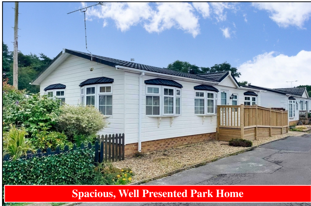
Spacious, Well Presented Park Home

150a Pinehurst Park, West Moors, Ferndown, Dorset. BH22 0BS