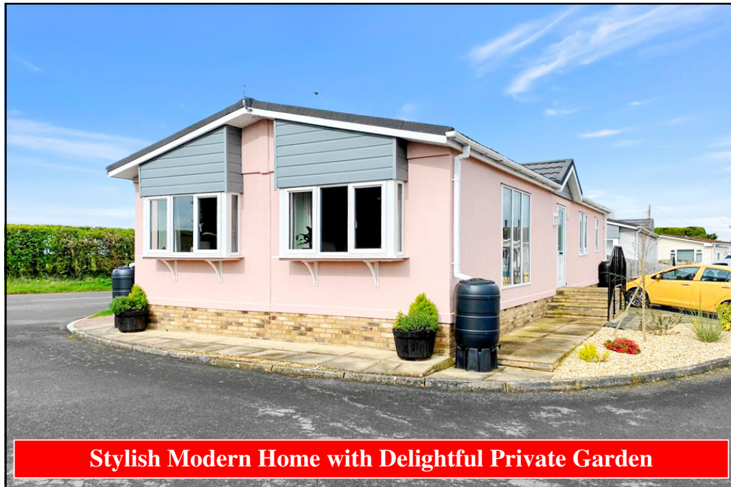
Stylish Modern Home with Delightful Private Garden

1 Orchard Park, West Camel, Yeovil. BA22 7QR