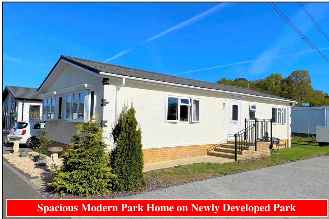
Spacious Modern Park Home on Newly Developed Park

5 Lupin Walk, Deer Court, Horton Road, Three Legged Cross, Wimborne. BH21 6FL