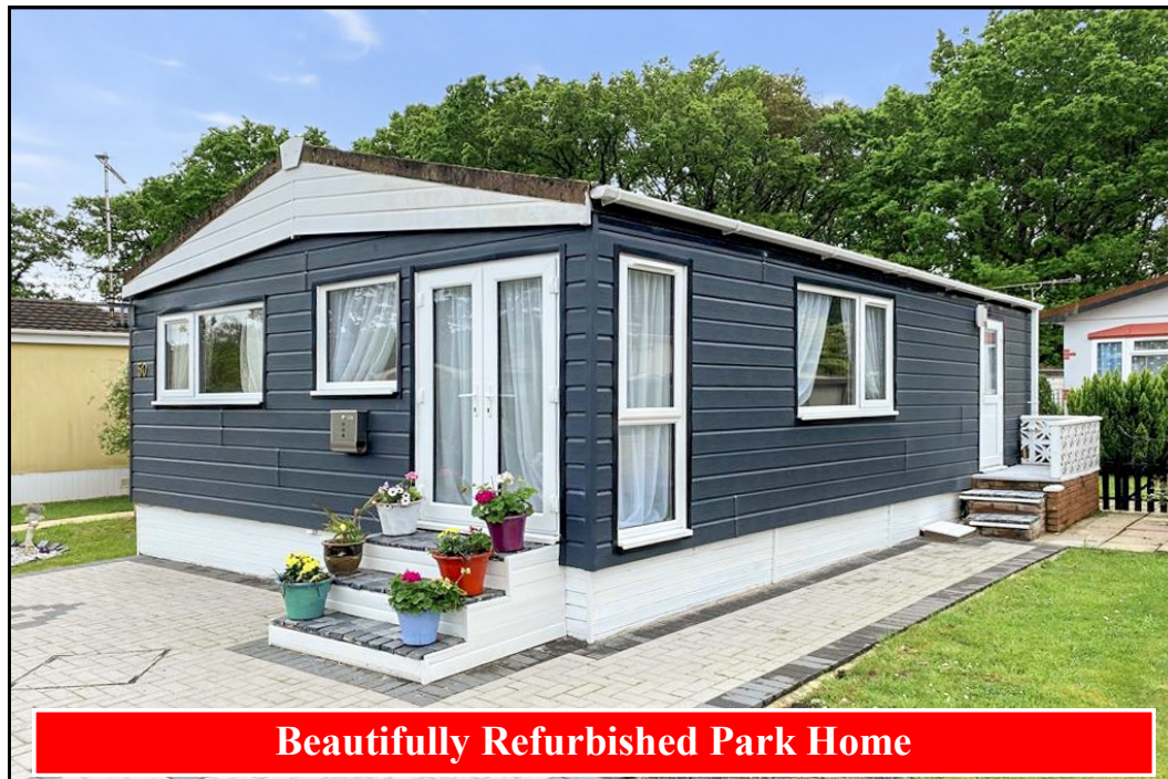
Beautifully Refurbished Park Home

50 Gladelands Park, Ringwood Road, Ferndown, Dorset. BH22 9BW