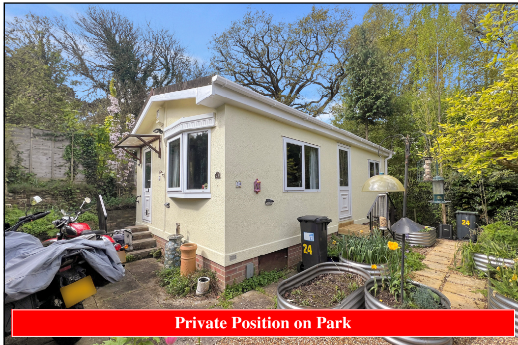
Private Position on Park

24 Redhill Park, Wimborne Road, Redhill, Bournemouth. BH10 7BW