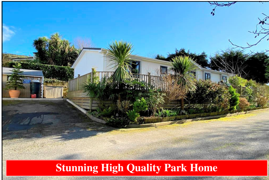
Stunning High Quality Park Home

11 Upton Glen Park, Upton, Ringstead, Dorchester, Dorset. DT2 8NE