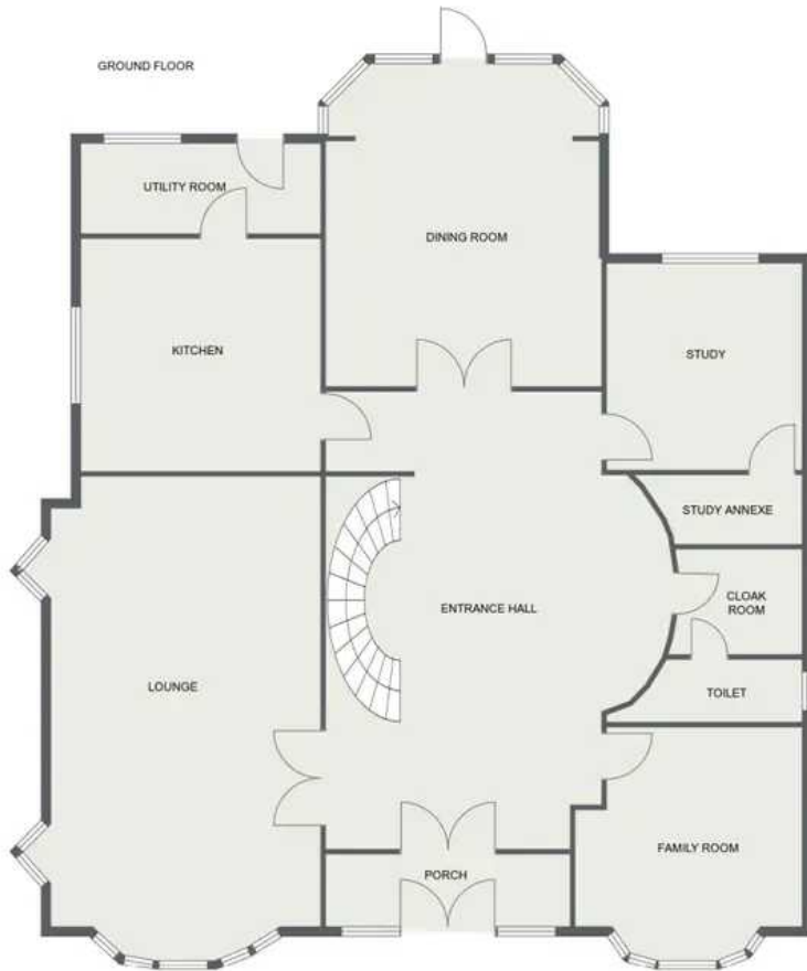
TOTAL G-FLOOR AREA IS APPROXIMATELY 240.56m 2 /2589.37sqft (INTERNAL MEASUREMENTS).