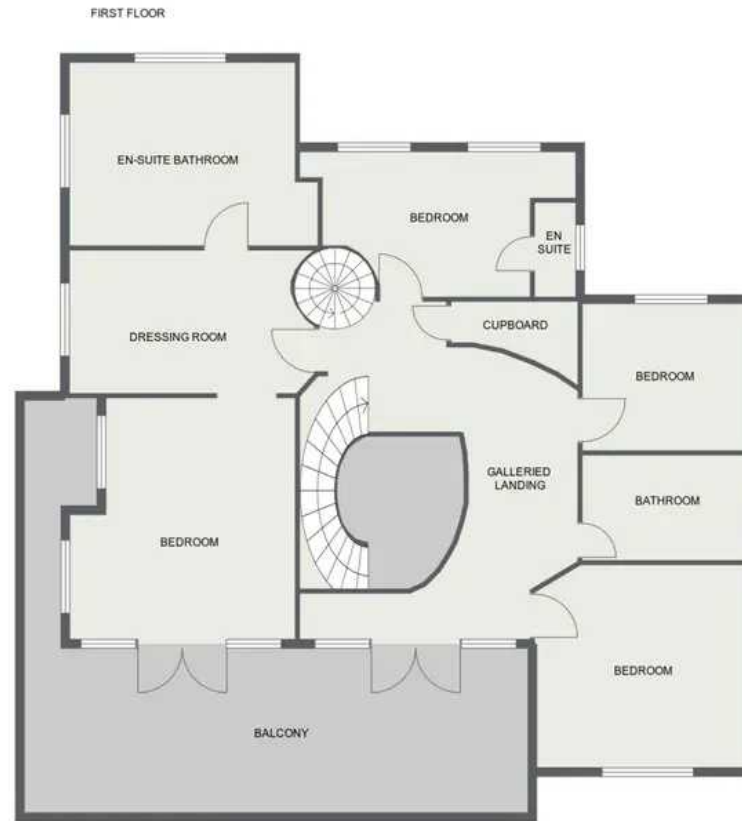
TOTAL 1ST/FLOOR AREA EXCLUDING BALCONY IS APPROXIMATELY 153.92m 2 /1656.78sqft (INTERNAL MEASUREMENTS).