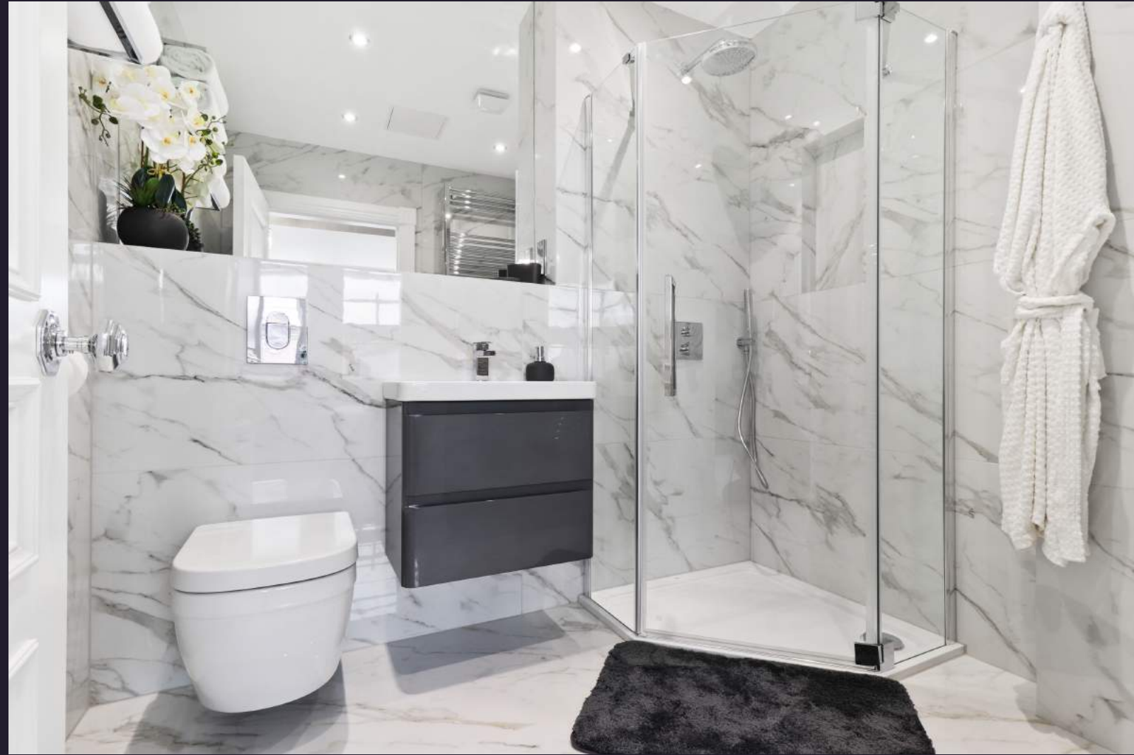
CHATSWORTH & GROHE BATHROOM FURNITURE