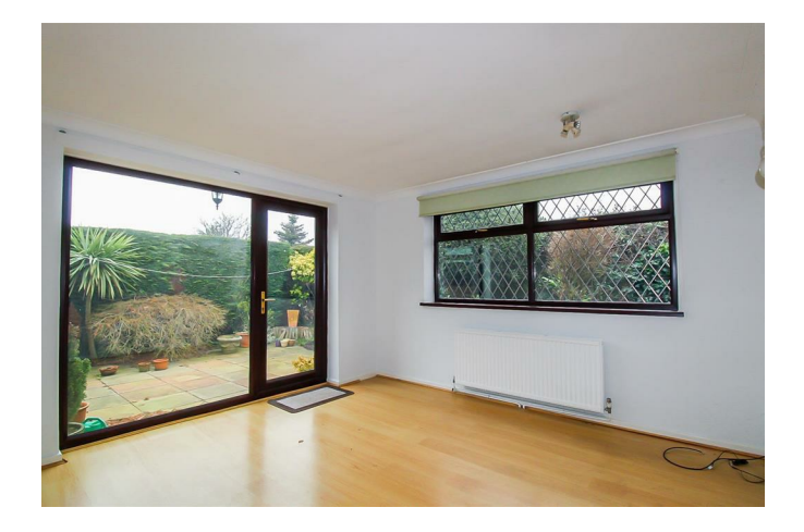
BEDROOM ONE 13'10" x 12'0" (4.24m x 3.67m) UPVC double glazed window to the front elevation, central heating radiator and built in built wardrobes and drawers.

UPVC double glazed windows to the rear and side elevation with side door and glass window panel, laminate flooring, central heating radiator and door to the other side leading out to the driveway.