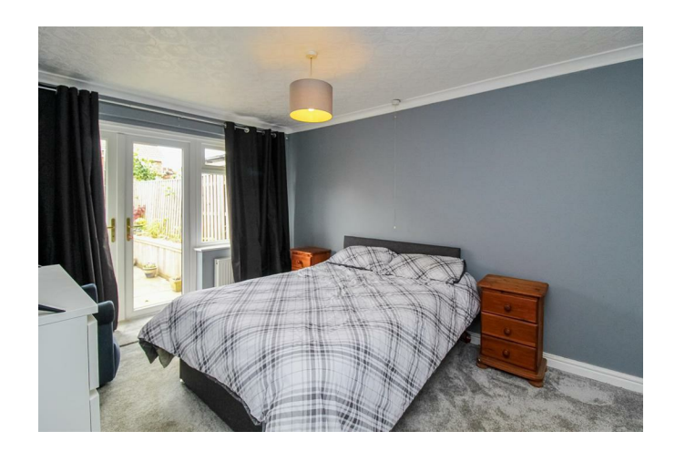
BEDROOM TWO 10'8" x 8'7" [3.26m x 2.63m]

UPVC double glazed window and French doors to the rear, radiator, coving to the ceiling and built in double wardrobe.