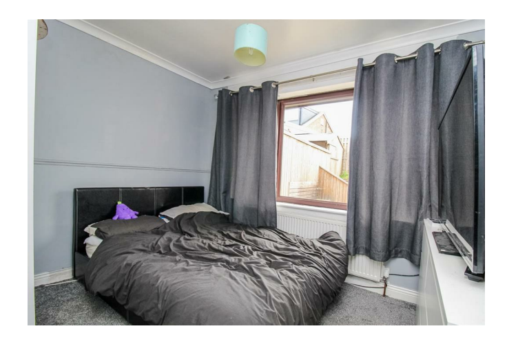
BEDROOM THREE 8'1" x 9'2" (2.47m x 2.81m)

UPVC double glazed window to the rear, radiator and coving to the ceiling.