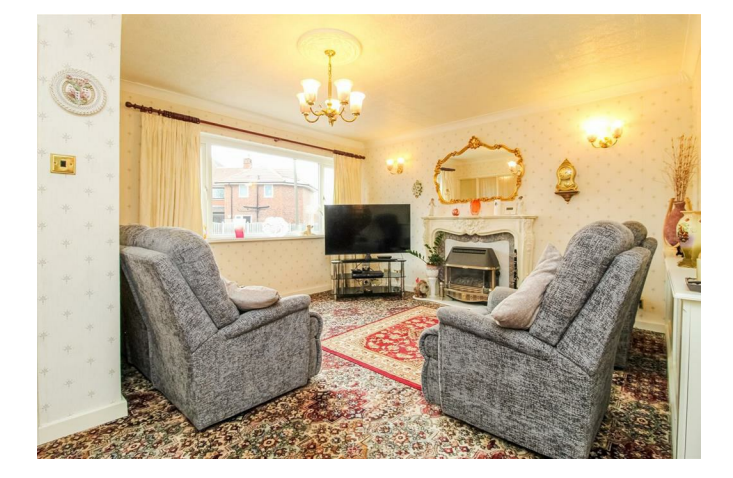
SITTING ROOM 11'5" x 10'10" (3.48m x 3.31m) Opening through to the dining room, opening into the kitchen, central heating radiator, access to understairs storage.

UPVC double glazed window to the front, double doors, central heating radiator, gas fireplace with marble hearth surround and laminate mantle, coving to the ceiling, ceiling rose.