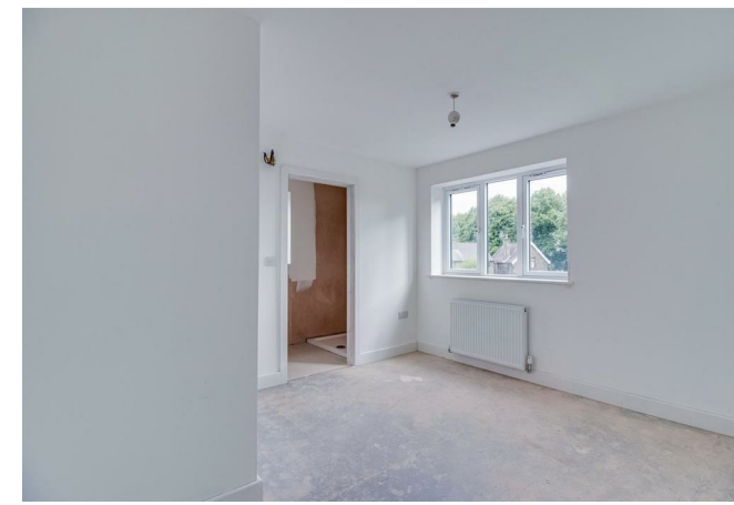
EN SUITE SHOWER ROOM/W.C. 3'10" x 8'7" [1.19m x 2.62m]

UPVC double glazed frosted window to the side. There will be a choice of bathroom and sanitary ware from Easy Bathrooms.