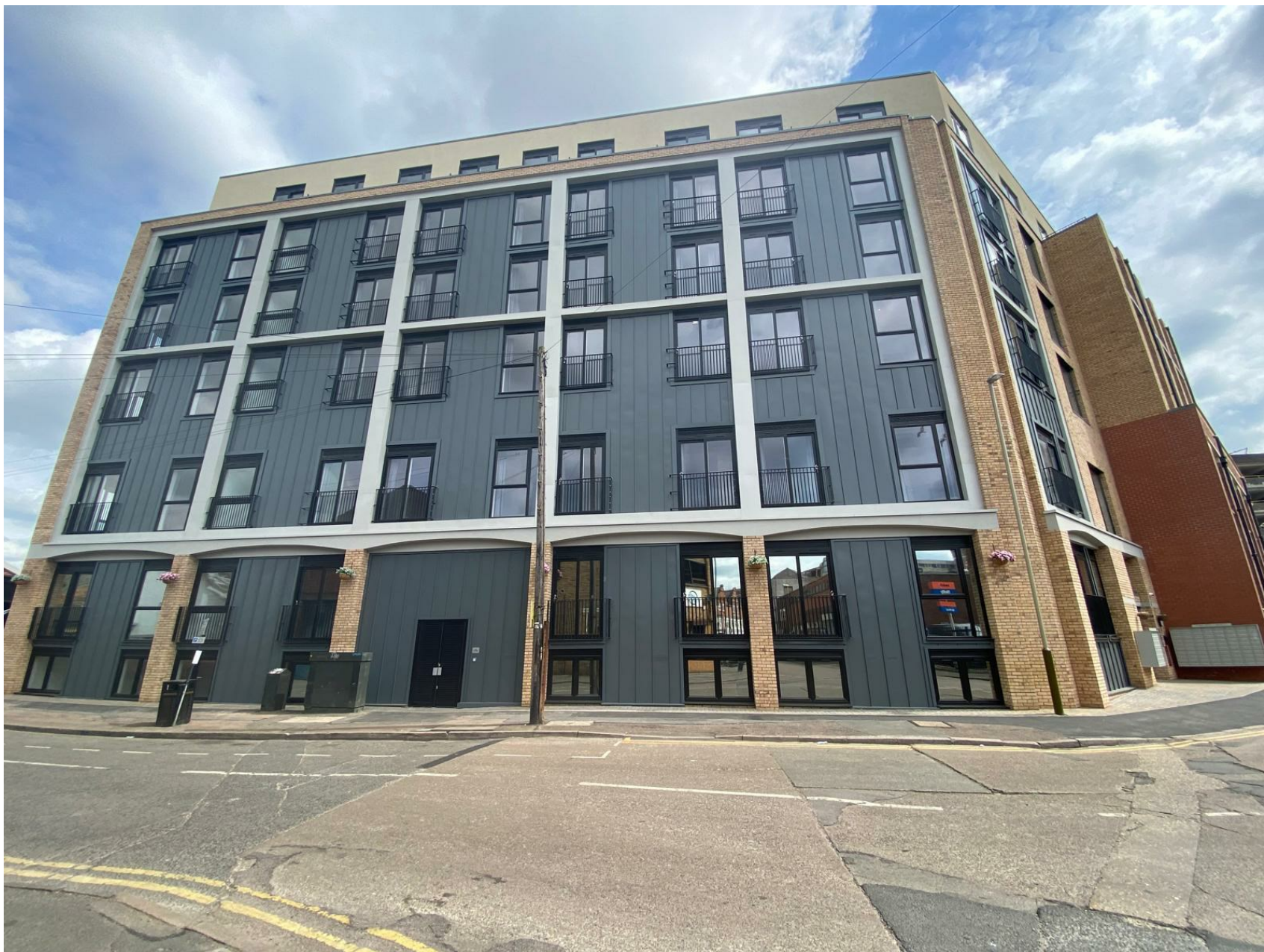
C74 Fleet Court, Leicester, LE1 3BJ £660 Per Calendar Month