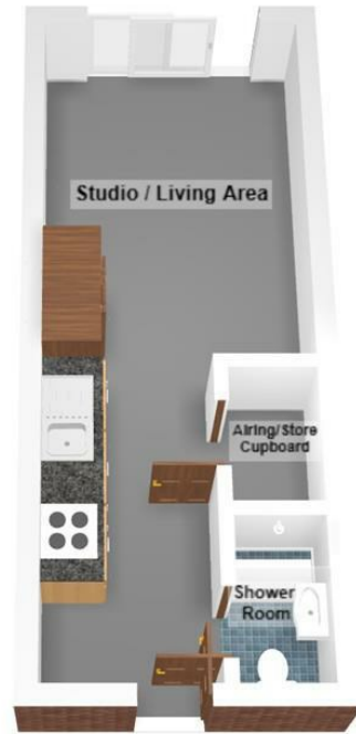
Fleet Court, Fleet House, Fleet Street, Leicester, LE1 3BJ

All measurements are approximate and for display purposes only