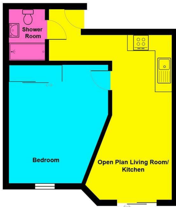
Fleet Court, Byron Street, Leicester, LE1 3BJ

All measurements are approximate and for display purposes only