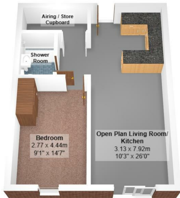
Fleet Court, Byron Street, Leicester, LE1 3BJ

All measurements are approximate and for display purposes only