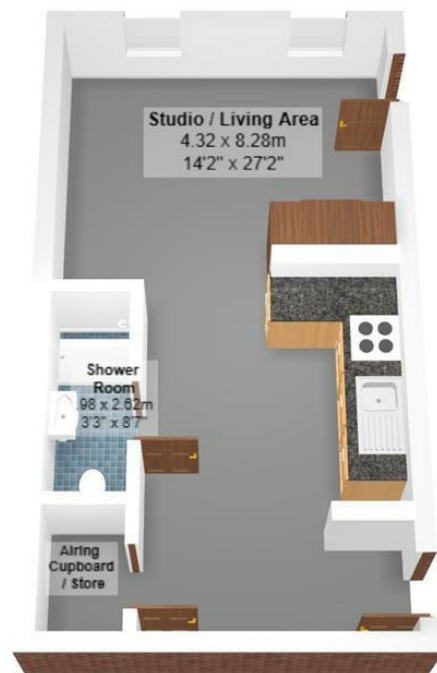
Fleet Court, Byron Street, Leicester, LE1 3BJ

All measurements are approximate and for display purposes only