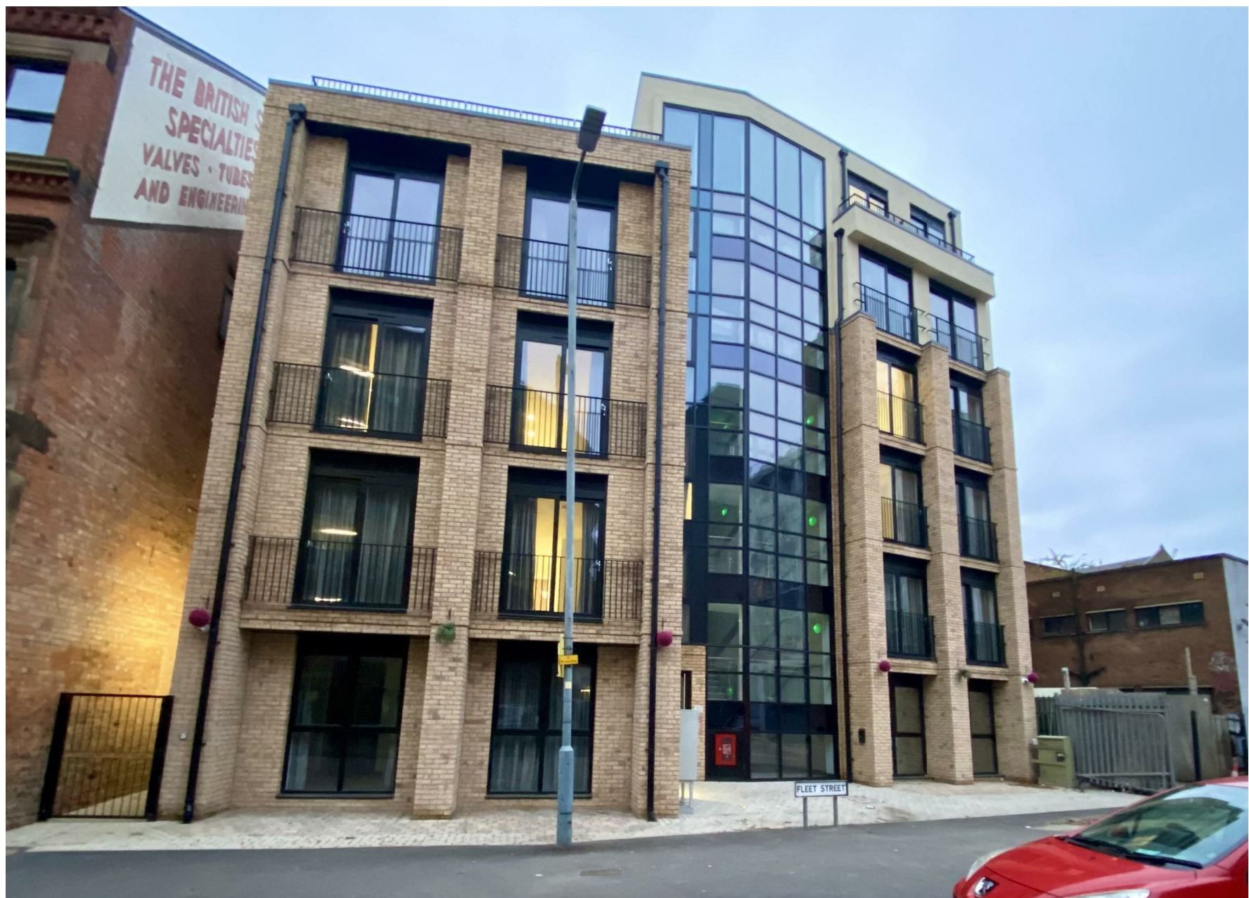
A1 Fleet Court, Leicester, LE1 3BA £660 Per Calendar Month