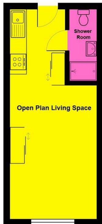
Fleet Street, Leicester, LE1 3AZ

All measurements are approximate and for display purposes only