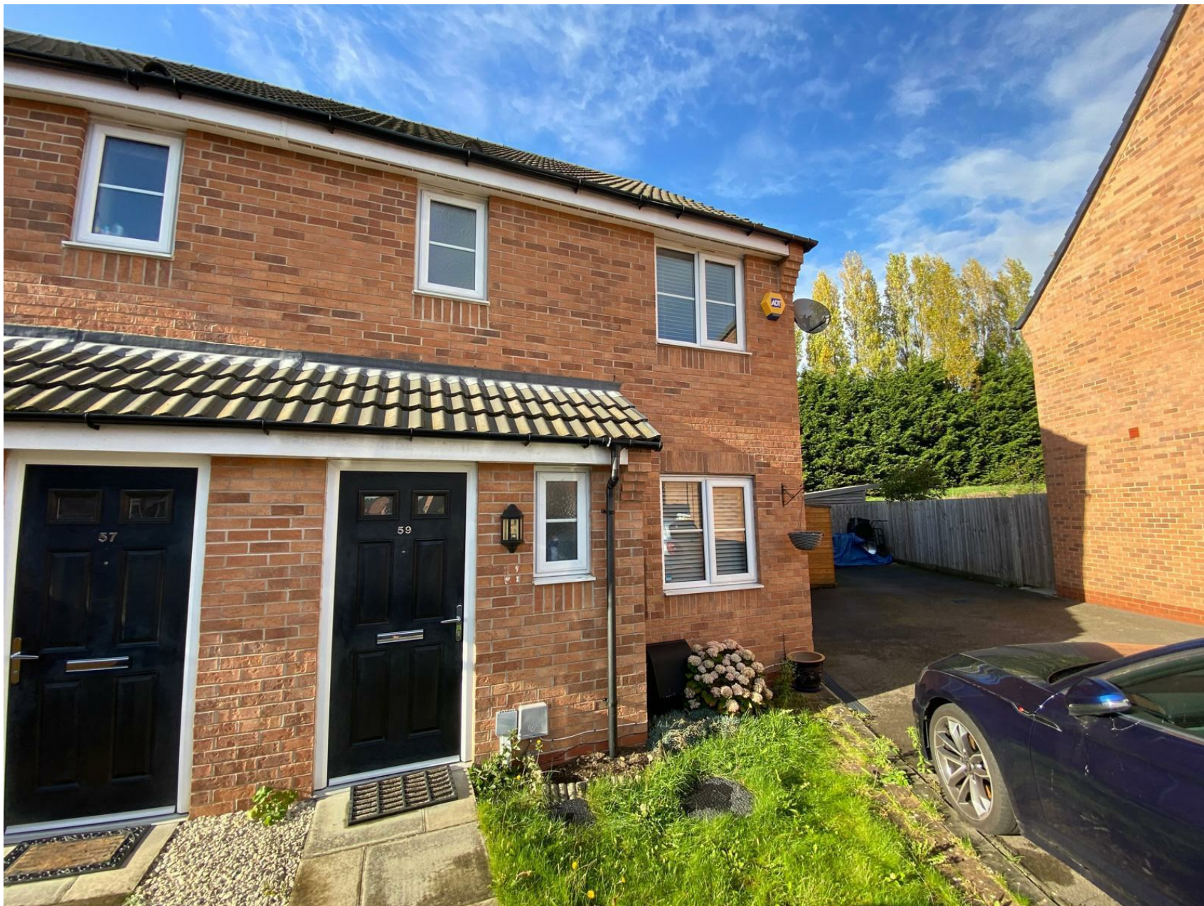
59 Slate Drive, Hinckley, LE10 2QP £1,170 Per Calendar Month