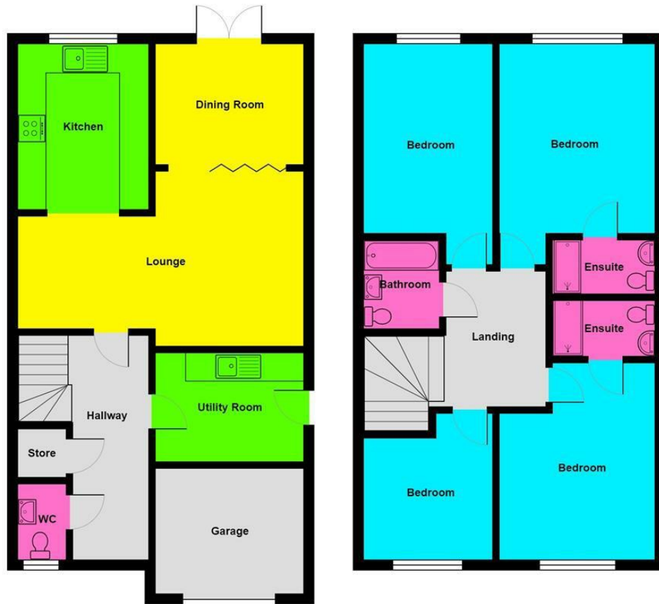
The Old Orchard House, Nutts Lane, Hinckley, LE10 3EG