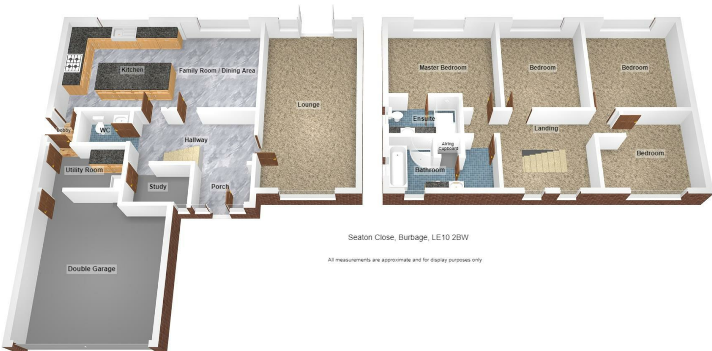
Seaton Close, Burbage, LE10 2BW

All measurements are approximate and for display purposes only