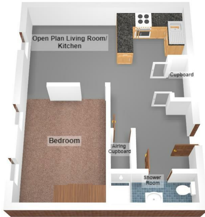
All measurements are approximate and for display purposes only