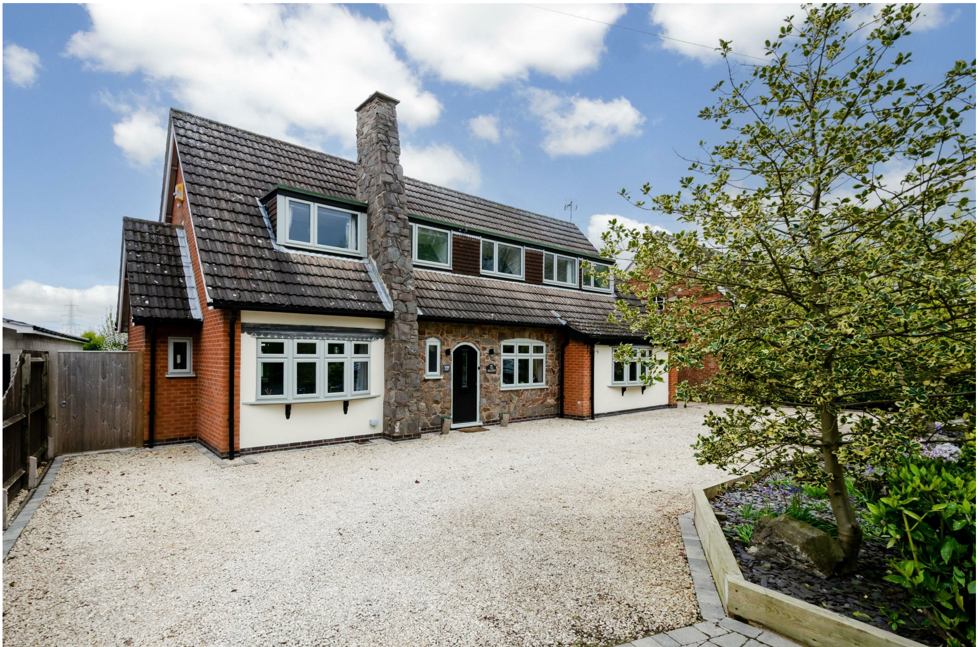
The Meadows Hinckley Road, Aston Flamville, LE10 2HQ £700,000