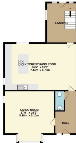
GROUND FLOOR 880 sq ft. (81.3 sq.m.) approx.