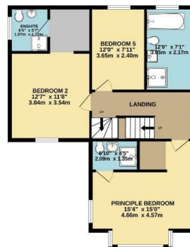
1ST FLOOR 818 N.E. (776.94 m 2 ) approx.