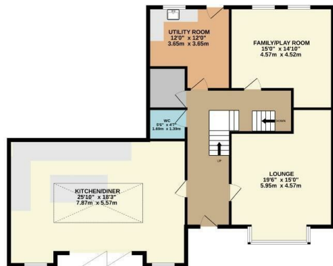
GROUND FLOOR 1412 N.E. (1335.94 m 2 ) approx.