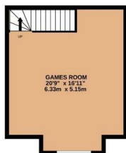
GROUND FLOOR 333 N.E. (103.76 m 2 ) approx.