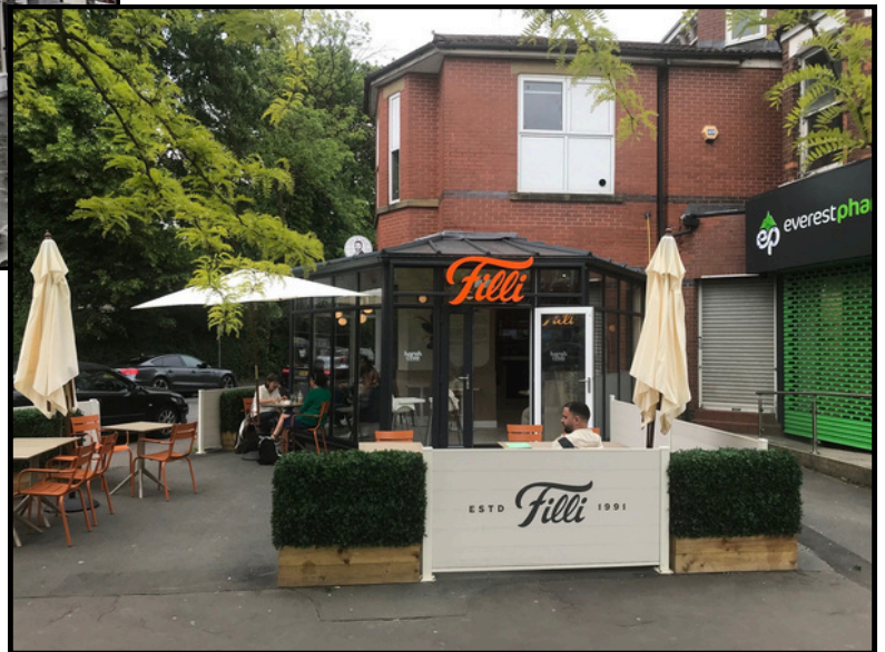
496b Wilbraham Road