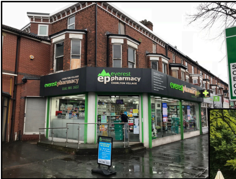
496 Wilbraham Road