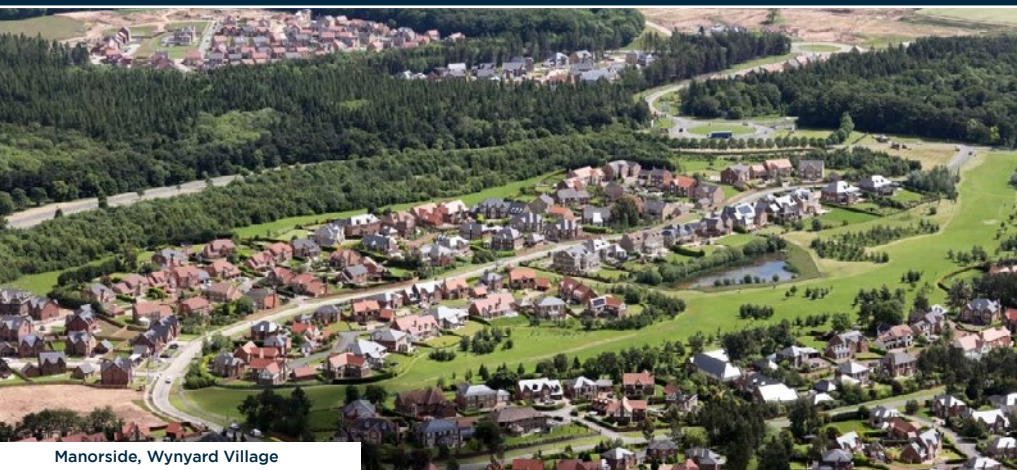
Manorside, Wynyard Village

3,755,000 sqft of commercial space employing over 4,000 people