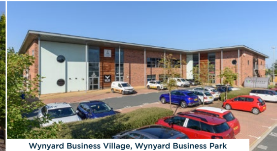
Wynyard Business Village, Wynyard Business Park