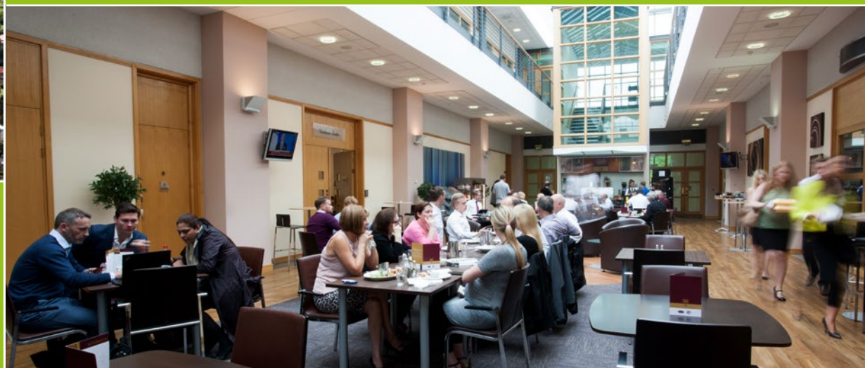
Wynyard Park House, Wynyard Business Park