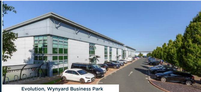
Evolution, Wynyard Business Park

Approximately 1,800 approval/under consideration