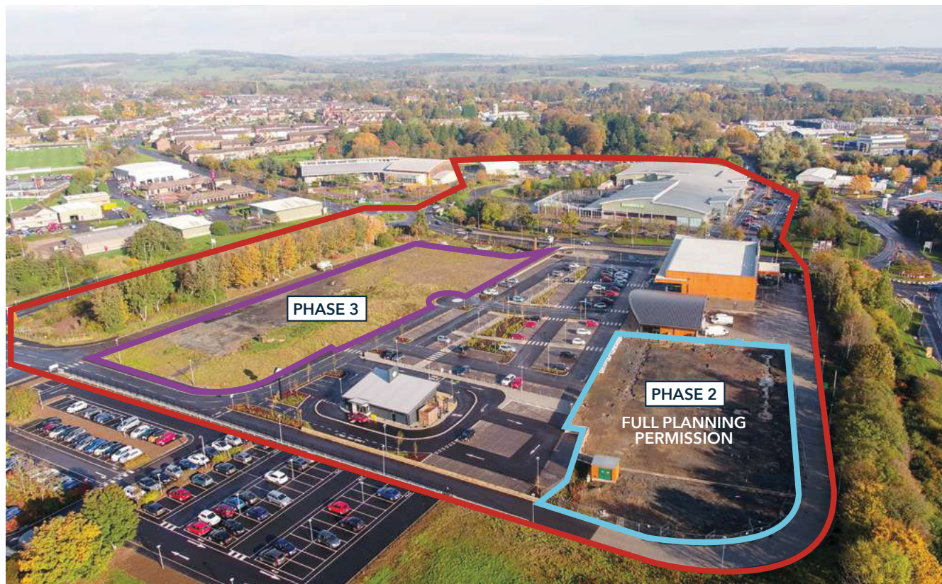
WILLOWBURN RETAIL PARK