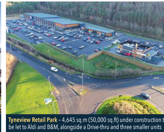
Tyneview Retail Park - 4,645 sq.m (50,000 sq.ft) under construction to be let to Aldi and B&M, alongside a Drive-thru and three smaller units