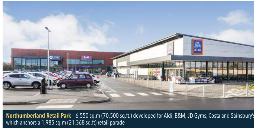
Northumberland Retail Park - 6,550 sq.m (70,500 sq.ft.) developed for Aldi, B&M, JD Gyms, Costa and Sainsbury's which anchors a 1,985 sq.m (21,368 sq.ft) retail parade