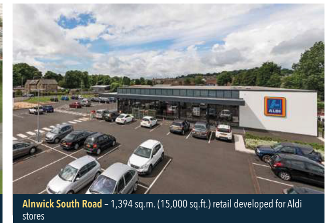
Alnwick South Road - 1,394 sq.m. (15,000 sq.ft.) retail developed for Aldi stores