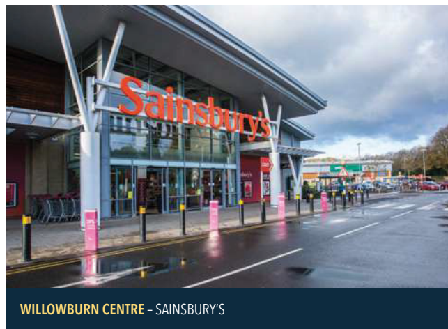
WILLOWBURN CENTRE - SAINSBURY'S

Willowburn Retail Park is immediately accessible from the A1 north and south bound slip roads into Alnwick Town and lies adjacent the A1, providing fantastic visibility.