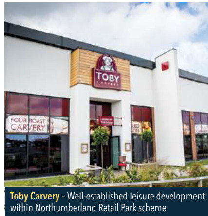
Toby Carvery - Well-established leisure development within Northumberland Retail Park scheme