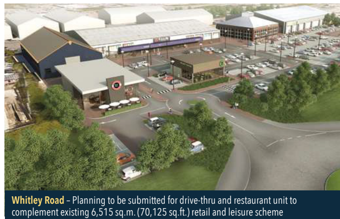
Whitley Road - Planning to be submitted for drive-thru and restaurant unit to complement existing 6,515 sq.m. (70,125 sq.ft.) retail and leisure scheme