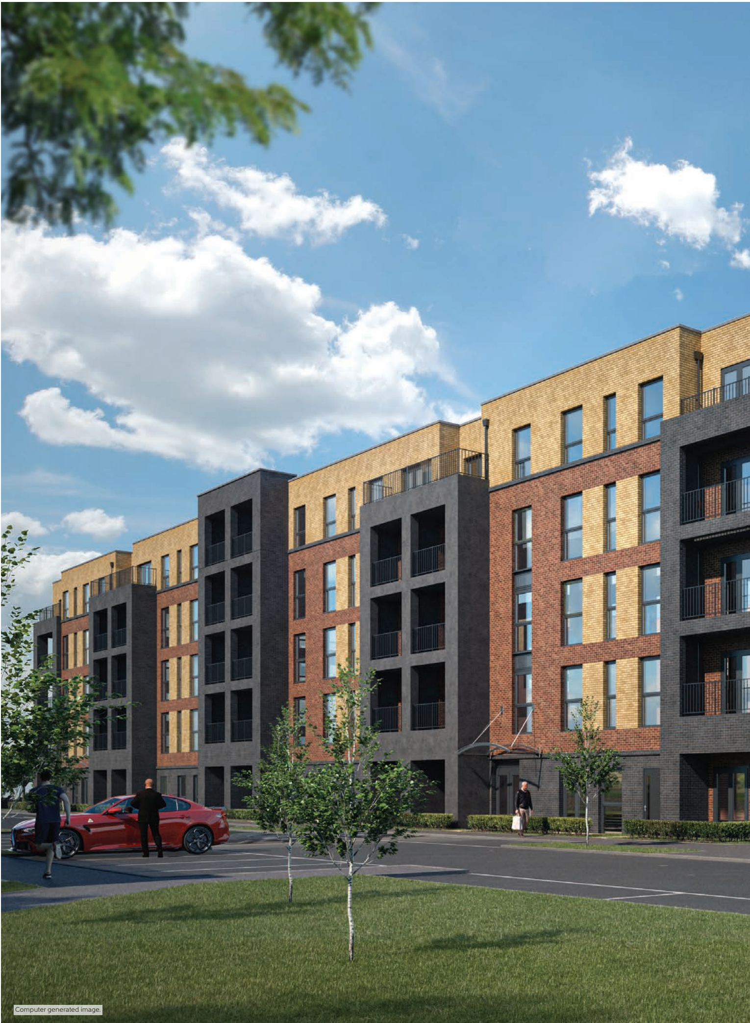
Computer generated image.