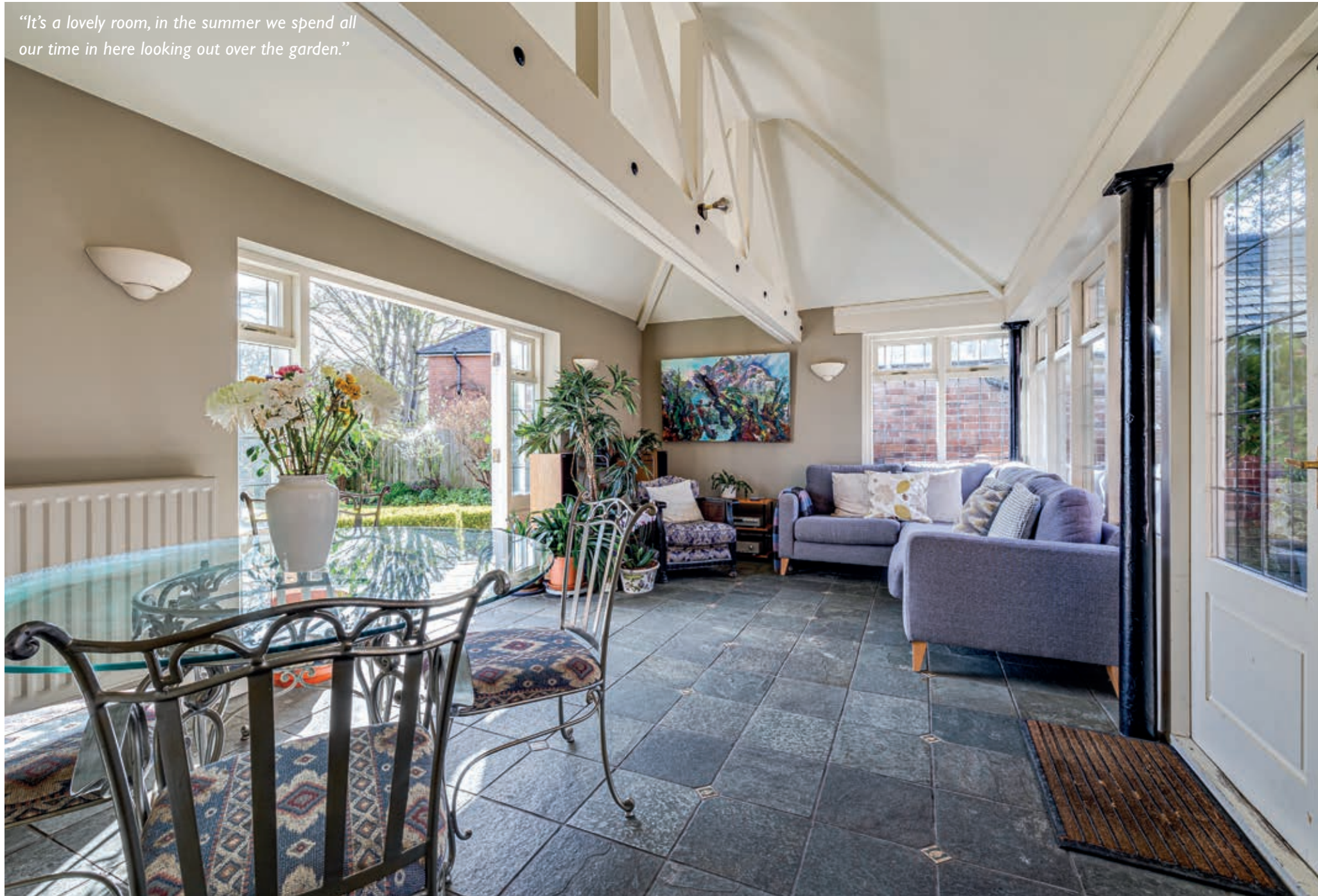
Wood Bank, Curzon Park North