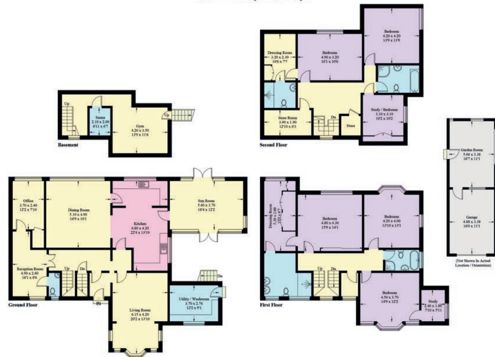
Illustration for identification purposes only, measurements are approximate, not to scale. floorplansUsketch.com © (ID948967)