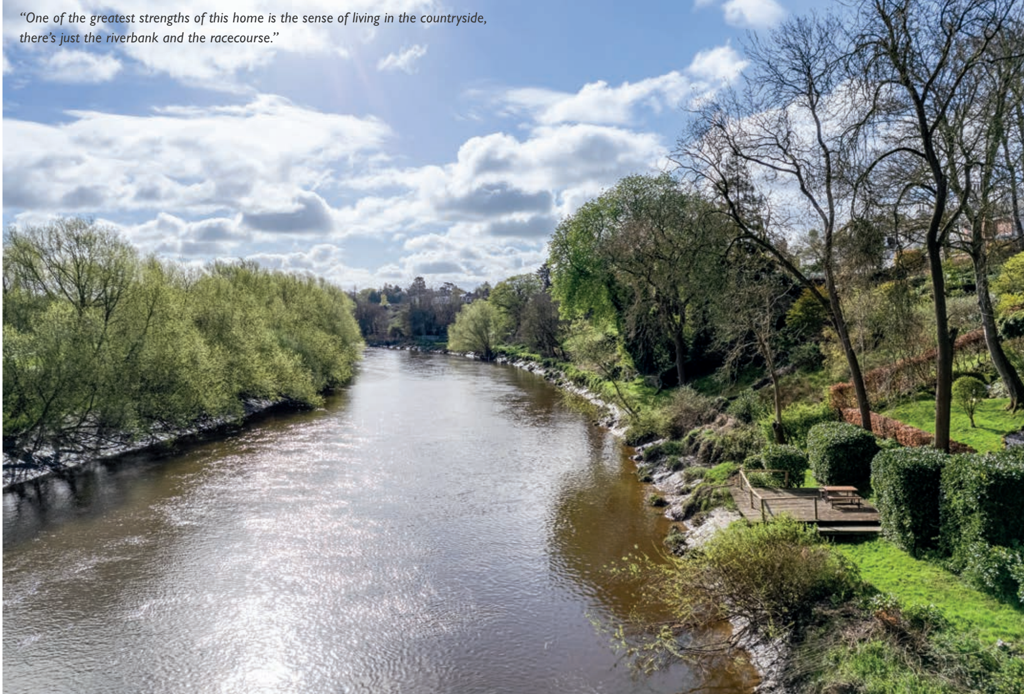
Wood Bank, Curzon Park North

“One of the greatest strengths of this home is the sense of living in the countryside, there’s just the riverbank and the racecourse.”