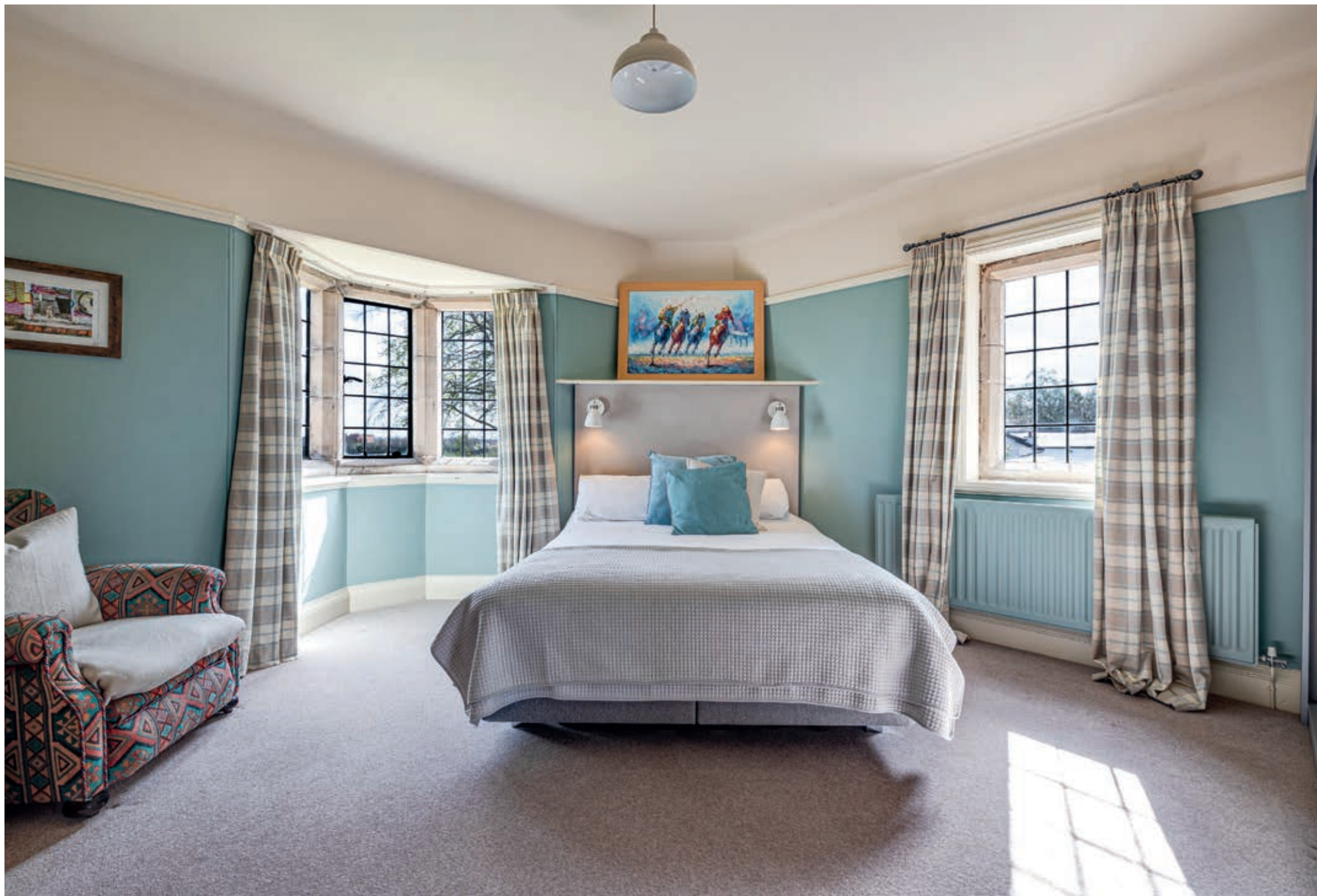
Wood Bank, Curzon Park North