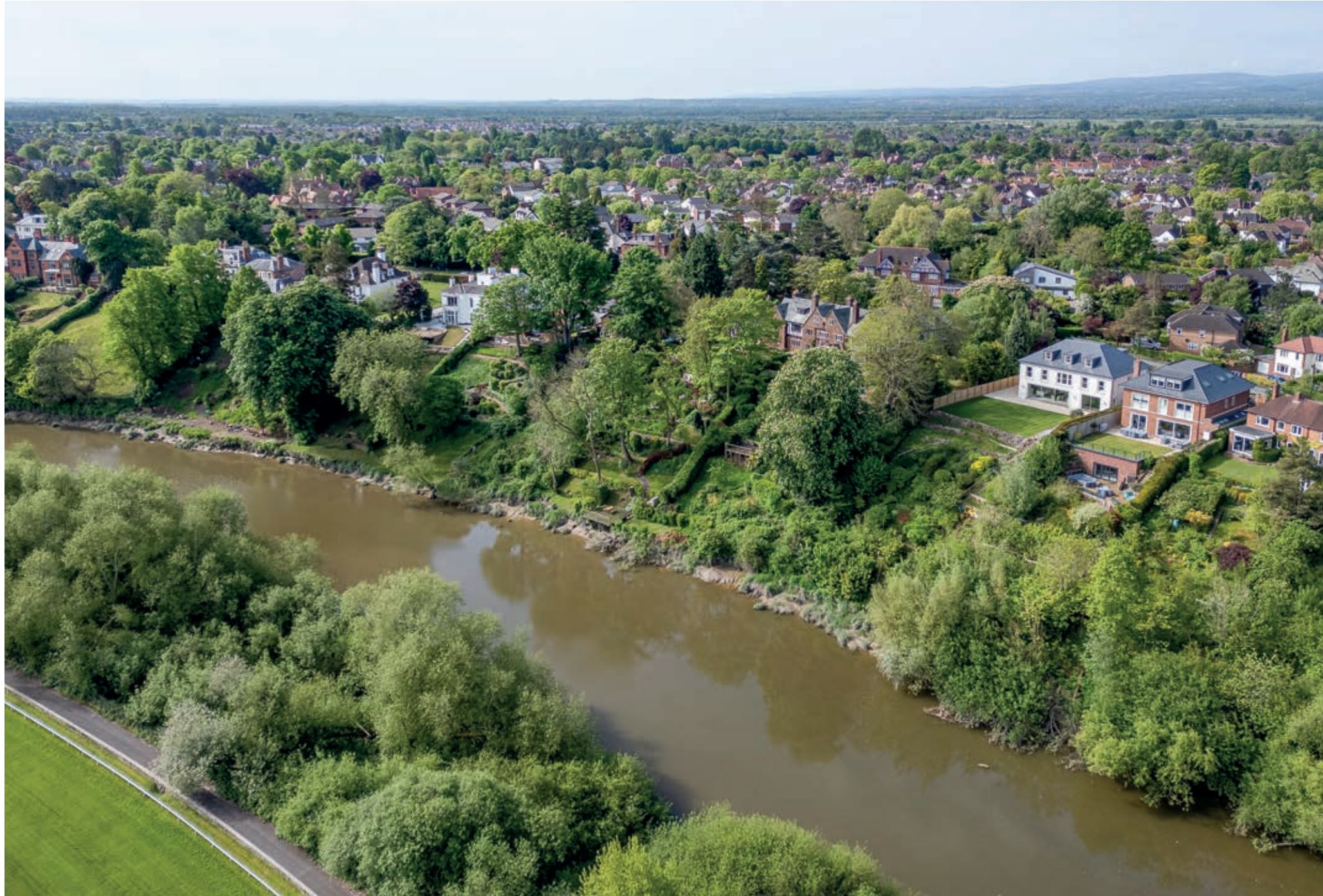
Wood Bank, Curzon Park North