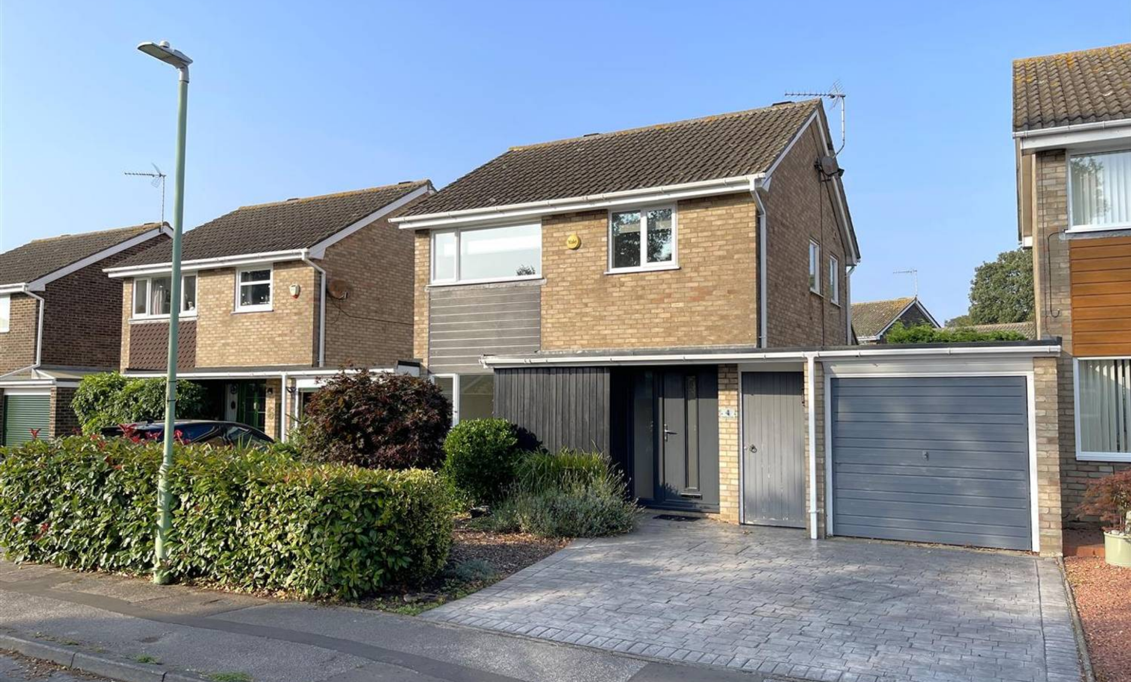
4 Rembrandt Close, Lowestoft £330,000