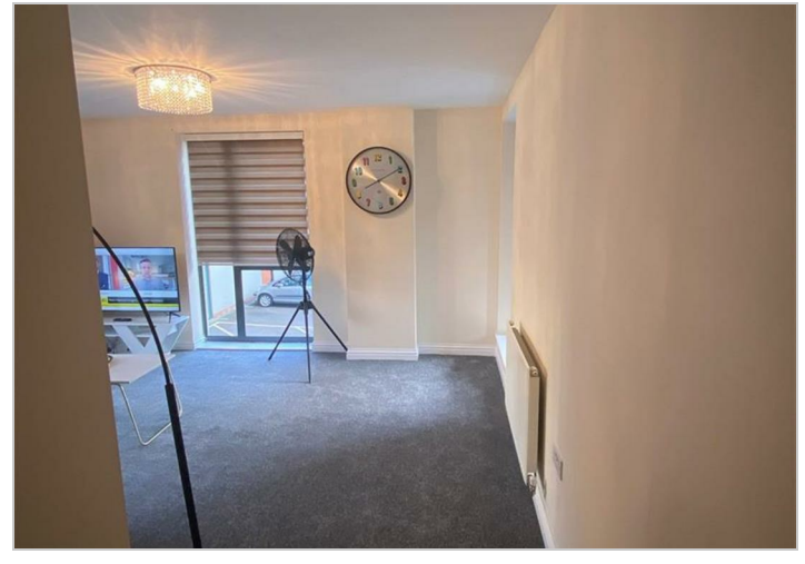
These particulars, whilst believed to be accurate are set out as a general outline only for guidance and do not constitute any part of an offer or contract. Intending purchasers should not rely on them as statements of representation of fact, but must satisfy themselves by inspection or otherwise as to their accuracy. No person in this firms employment has the authority to make or give any representation or warranty in respect of the property.