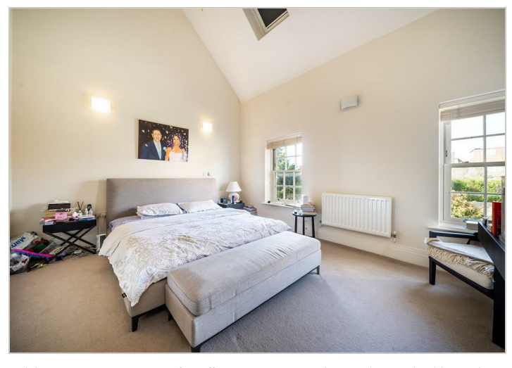
These particulars, whilst believed to be accurate are set out as a general outline only for guidance and do not constitute any part of an offer or contract. Intending purchasers should not rely on them as statements of representation of fact, but must satisfy themselves by inspection or otherwise as to their accuracy. No person in this firms employment has the authority to make or give any representation or warranty in respect of the property.