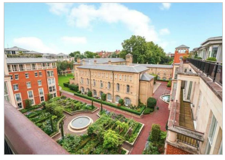
These particulars, whilst believed to be accurate are set out as a general outline only for guidance and do not constitute any part of an offer or contract. Intending purchasers should not rely on them as statements of representation of fact, but must satisfy themselves by inspection or otherwise as to their accuracy. No person in this firms employment has the authority to make or give any representation or warranty in respect of the property.