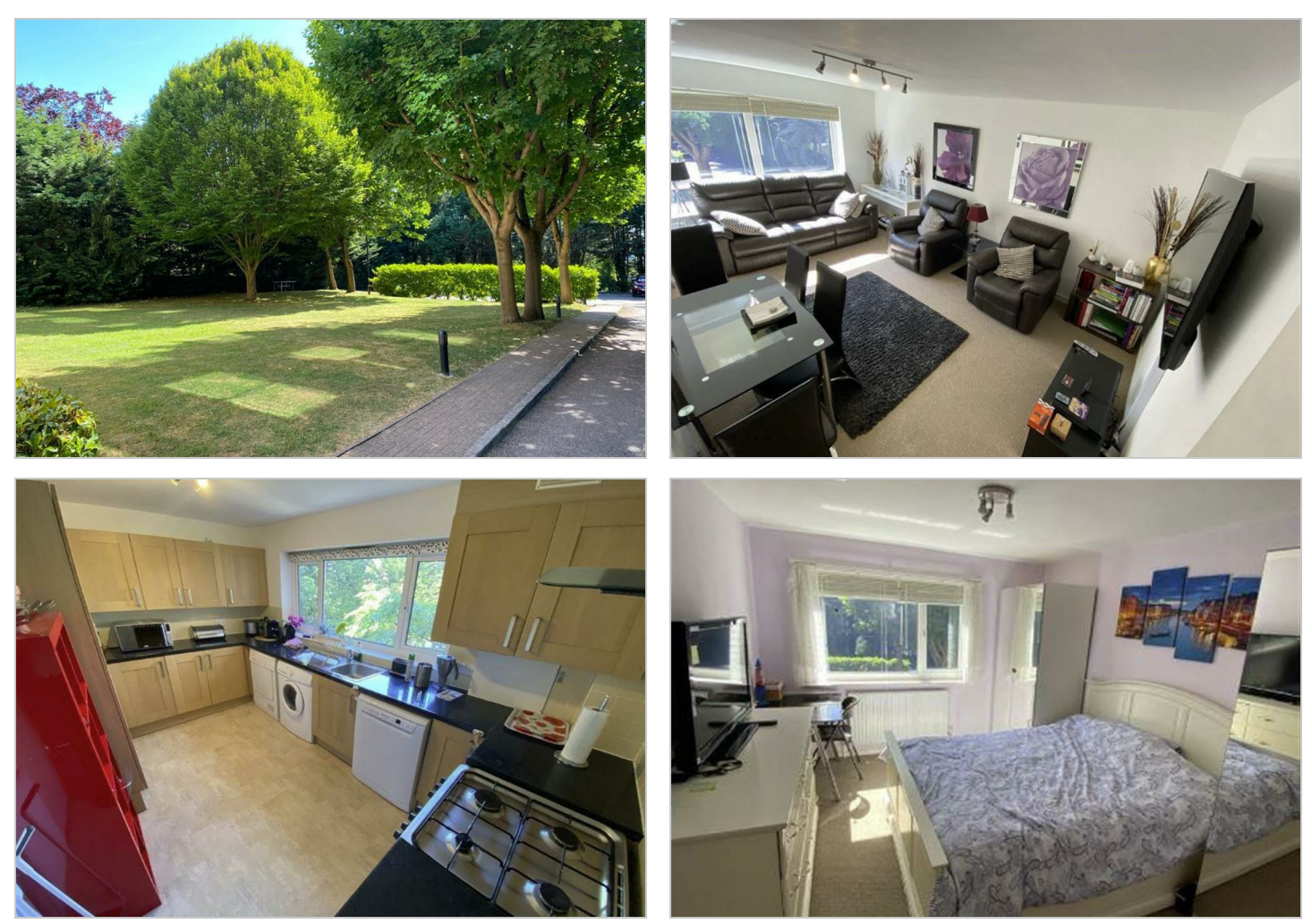
These particulars, whilst believed to be accurate are set out as a general outline only for guidance and do not constitute any part of an offer or contract. Intending purchasers should not rely on them as statements of representation of fact, but must satisfy themselves by inspection or otherwise as to their accuracy. No person in this firms employment has the authority to make or give any representation or warranty in respect of the property.

68 Caledonian Road, London, N1 9DP 020 3198 4517 kx@df-estates.com