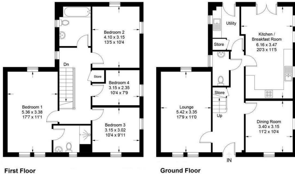
Illustration for identification purposes only, measurements are approximate.

Approximate Gross Internal Area = 142.1 sq m / 1529 sq ft