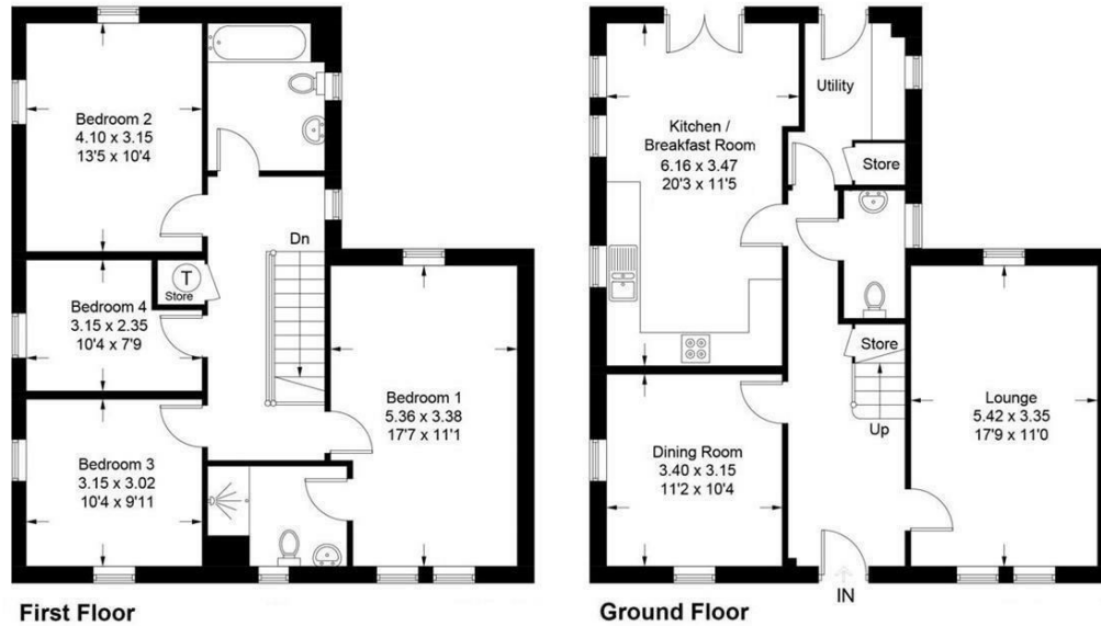
Illustration for identification purposes only, measurements are approximate,