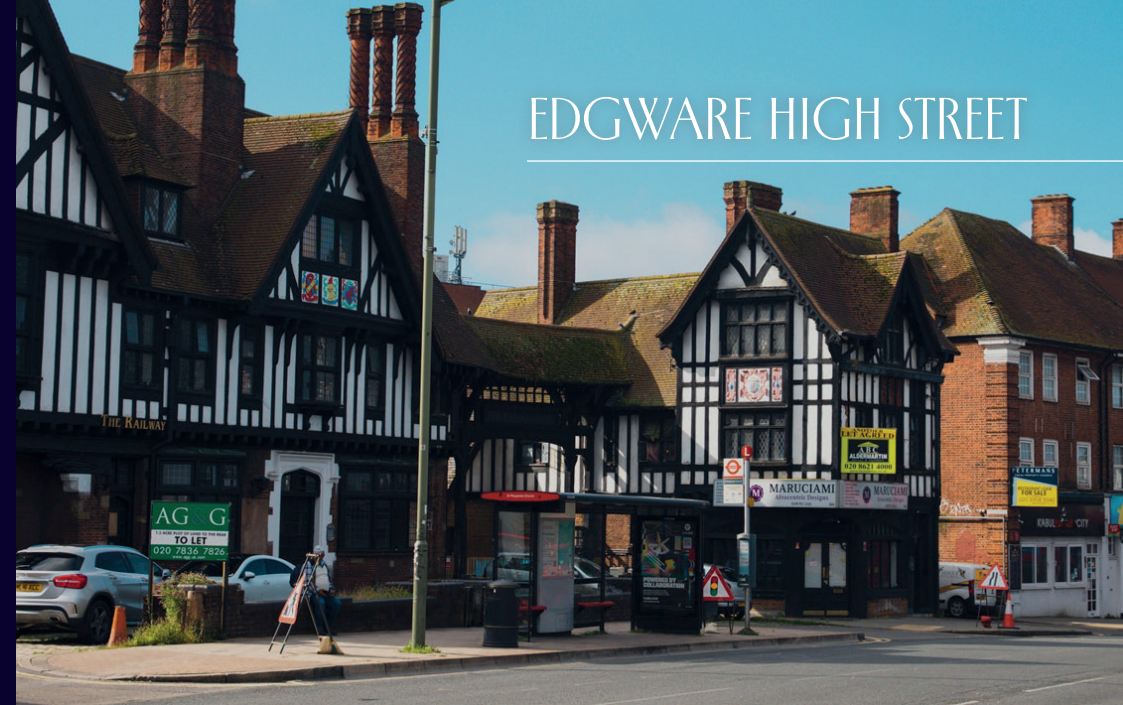
EDGWARE HIGH STREET

Edgware benefits from a suburban location with a close proximity to ample green spaces, such as Edgwarebury Park and Bushey Heath. Edgware is situated in Northwest London, located between Mill Hill & Stanmore.