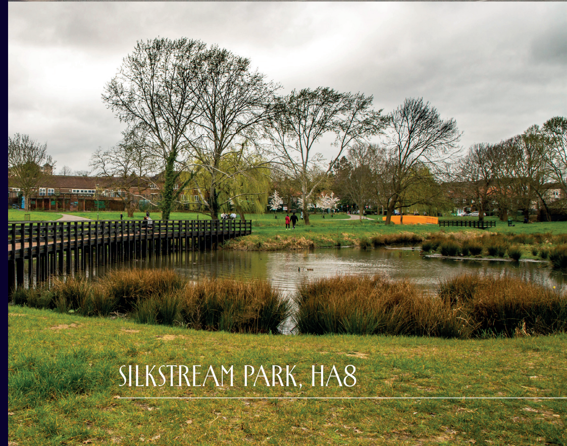
SILKSTREAM PARK, HA8