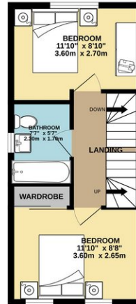
1ST FLOOR 321 sq.ft. (29.9 sq.m.) approx.