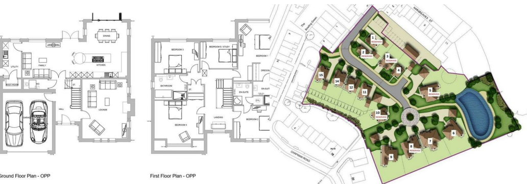
Ground Floor Plan - OPP

The homes will boast a high-quality specification throughout, including features such as underfloor heating to the ground floor, Karndean flooring to the kitchens and bathrooms, and electric vehicle charging points. The properties will also benefit from fully integrated kitchens with appliances including an oven, hob with extractor, fridge, freezer, dishwasher, and trendy quartz worktops will finish the design in style, while the bathrooms will be presented with half tiled walls and full tiling around the showers.