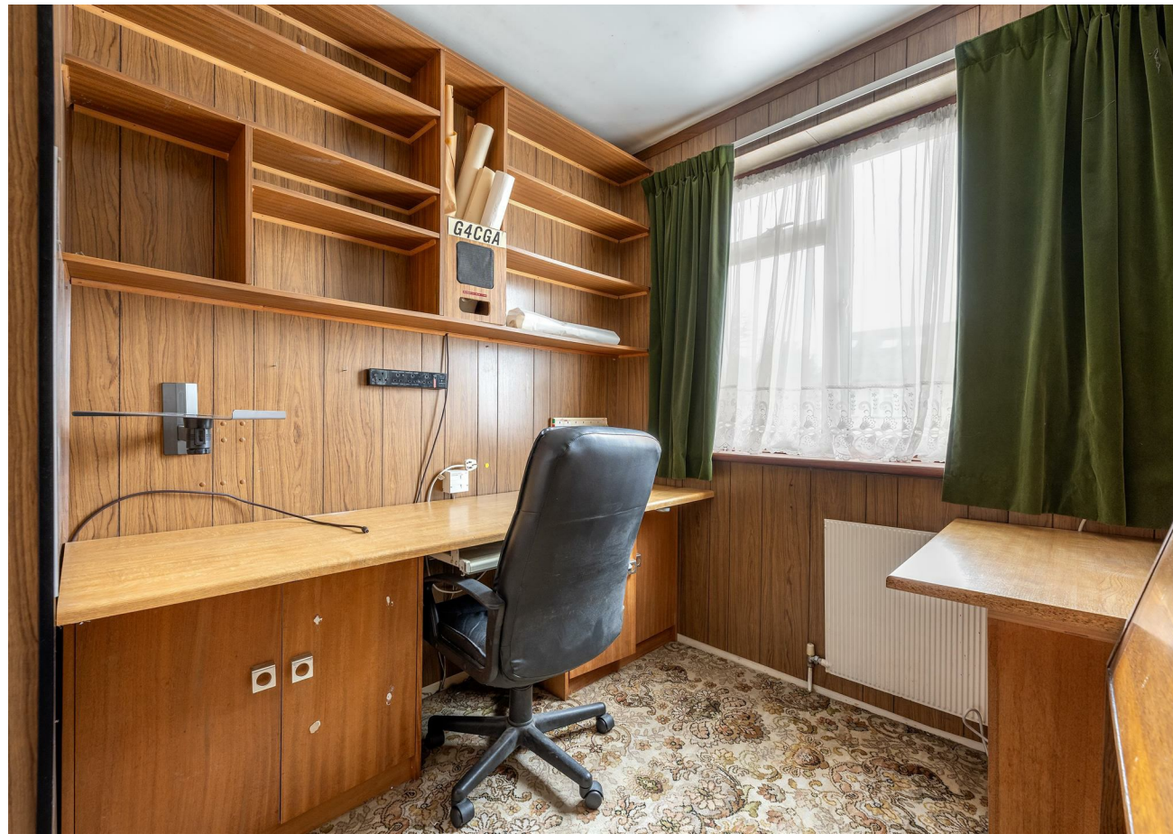
Reception 11'11" x 25'3"