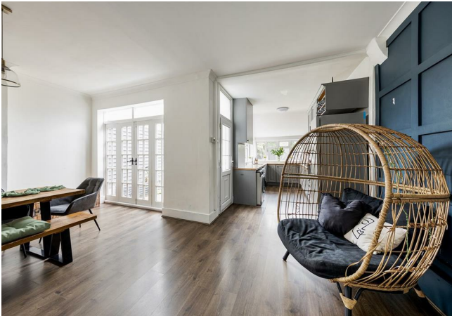
Reception Room 16'10" x 12'5"