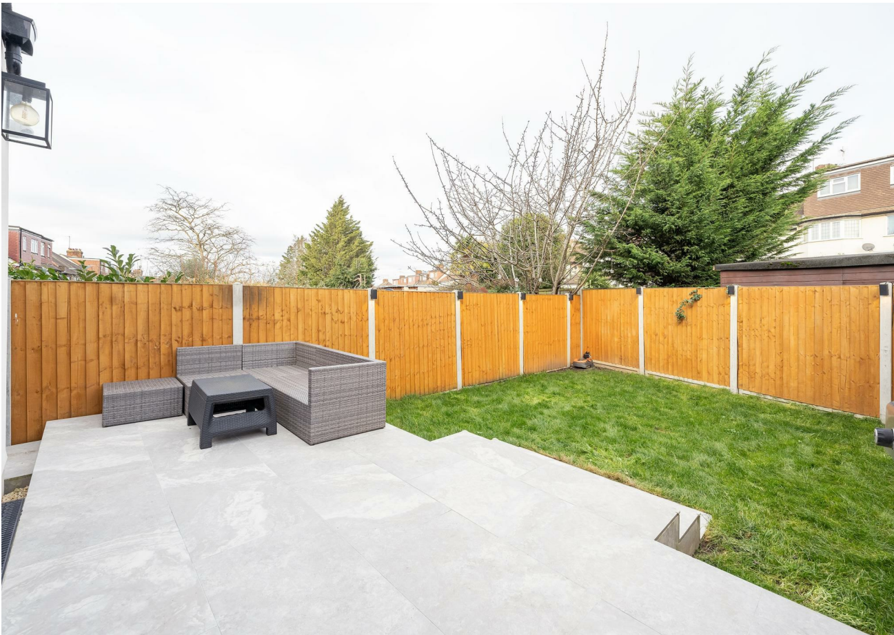
Garden 33'1" x 20'9"