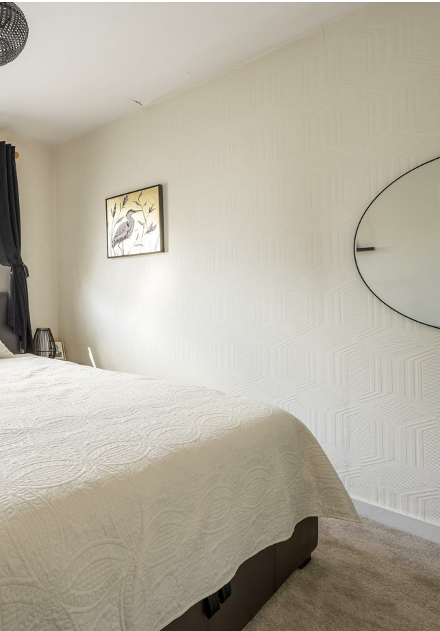
Bedroom 9'10" x 10'0"