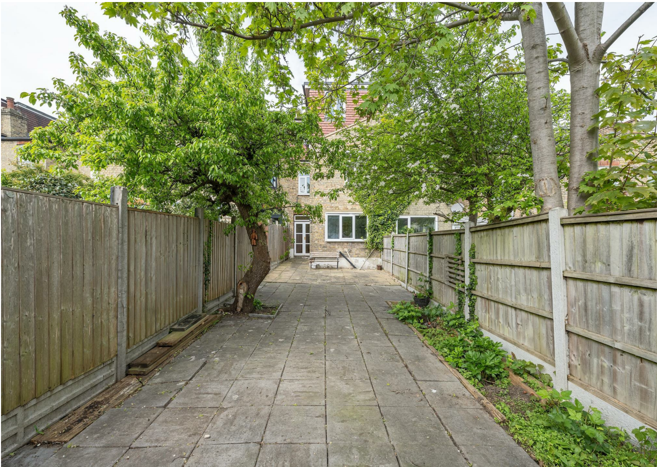
Garden 51'0" x 14'3"