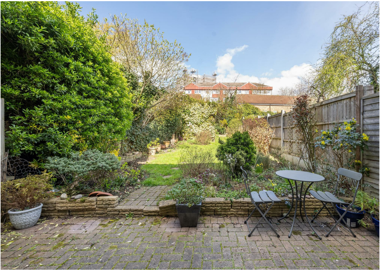
Garden 60'0" x 17'6"