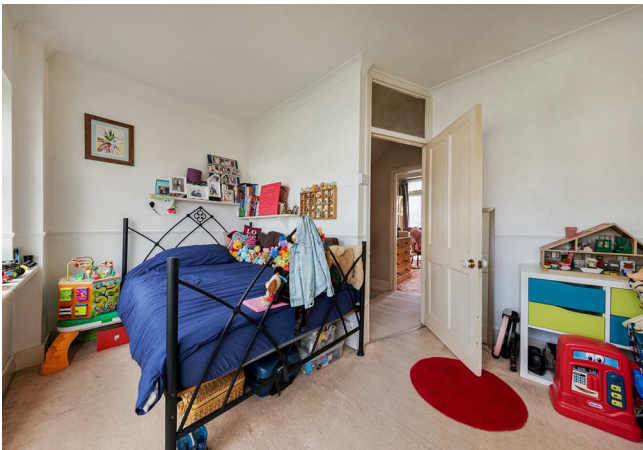
Bedroom 12'9" x 9'8"