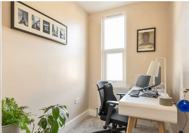
Bedroom 5'6" x 7'5"